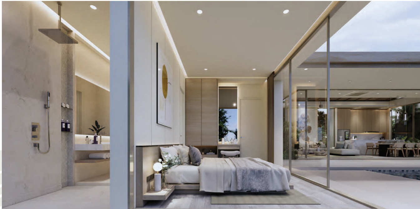
GUEST BEDROOM I